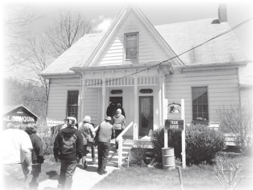
Attendees of the barn workshop on the day before the Barn Tour enter one of the two front doors of the farm house at Algonquin Mill in Carroll County.