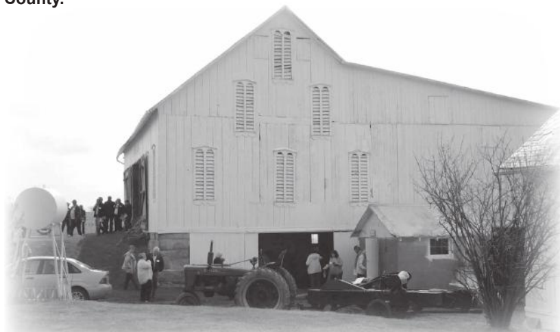
Barn tour attendees explore the 1854 Rutledge bank barn with its 1903 addition at the rear.