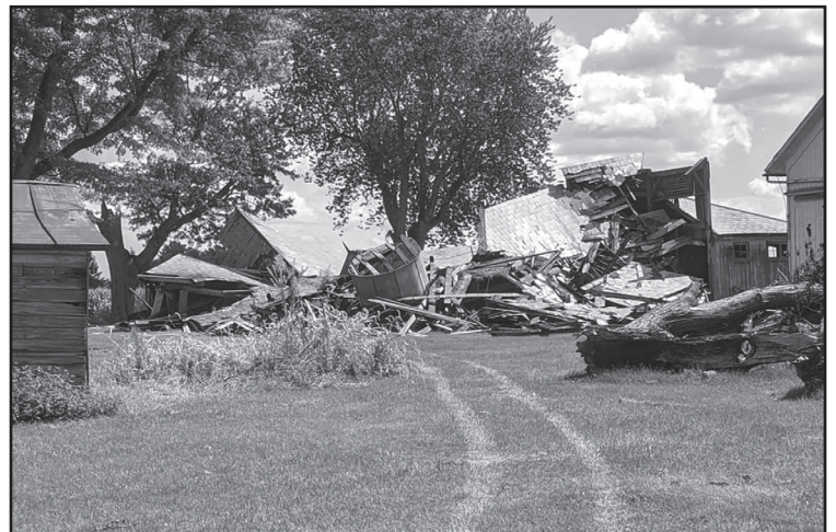
Above Left: Jones barn in the 21st century having received much less TLC over the previous 100 years. Larger hay-hood behind double gabled second story space.