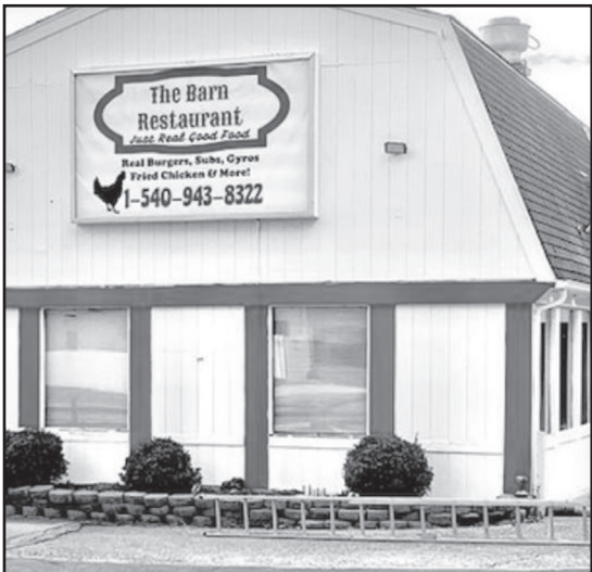
The Barn Restaurant – “Just Real Good Food”