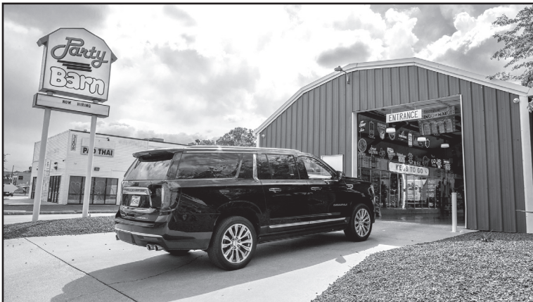
Party Barn – Kegs to Go