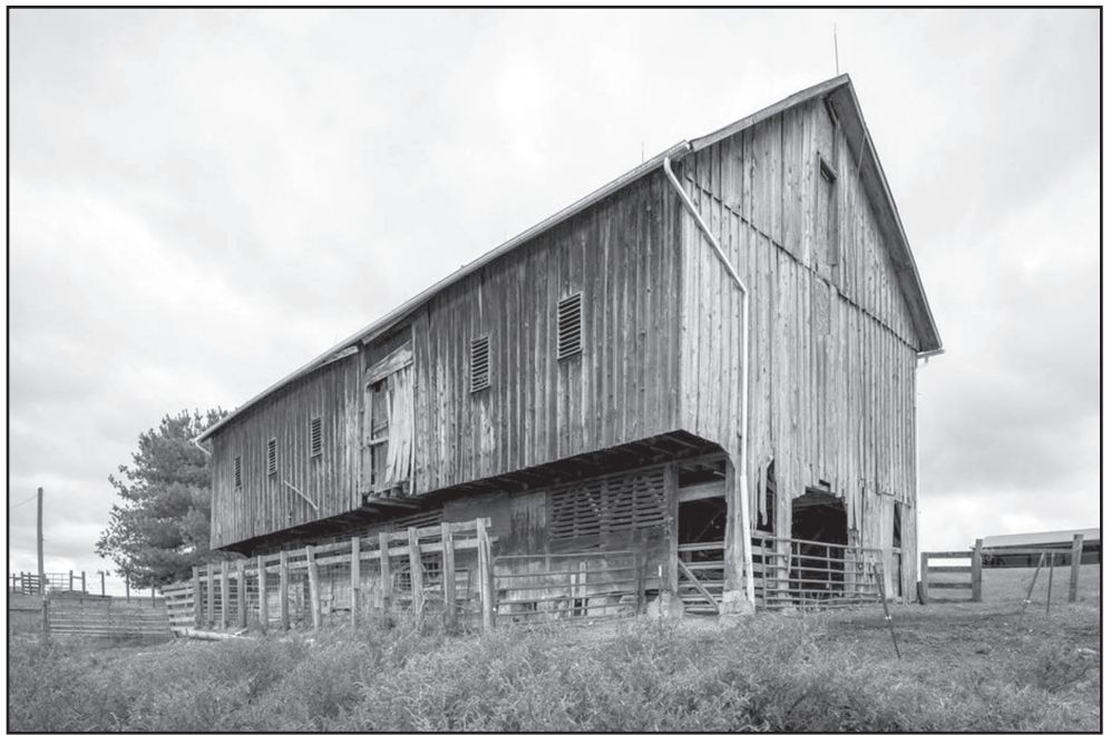
Overhanging forebay of a classic Pennsylvania German barn. Note wind doors and louvered vents on the level of the threshing floor and basement for livestock.