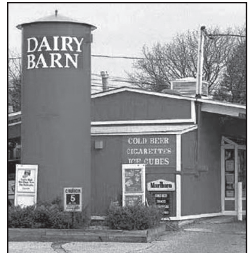
Dairy Barn – cold beer, cigarettes, and ice cubes