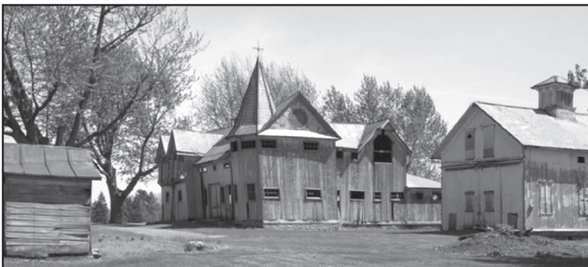
Left: Double gable space on second story at far left. Carriage house at right. Separate carriage house to extreme right.