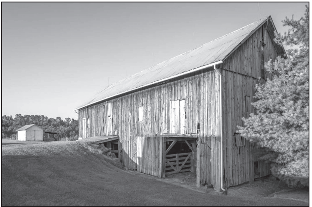
Since the barn was not built into a bank access, the threshing floor is reached by a massive stone ramp leading over a bridge entry.

Two other wooden structures also sit on the farm. There is a shed with a lean-to attached, as well as a small barn with a large lean-to surrounding two of its four sides. The small barn harbors an assortment of newer and antique tools. Especially notable, however, are the hand-hewn logs that comprise the structure. Though the exact history of the timbers isn't known, there are two main possibilities associated with them. Either the small log barn predates the Pennsylvania German barn, or the timbers framing the small barn were salvaged from an earlier structure, like an-