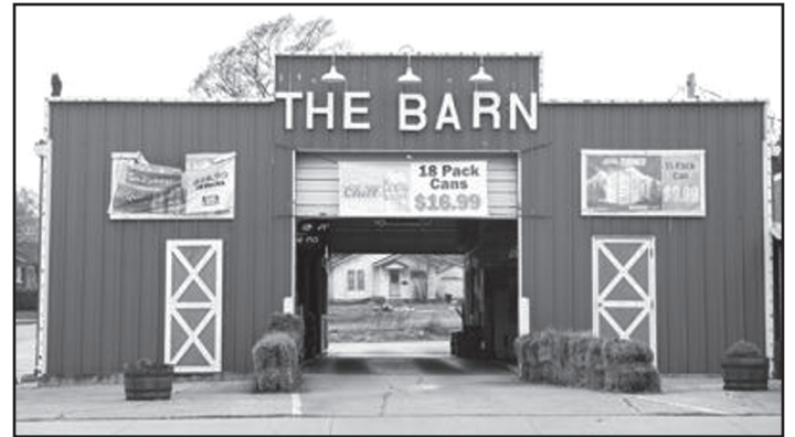
The Barn – Twelve packs and eighteen packs

These images are another reason why Friends of Ohio Barns exists.