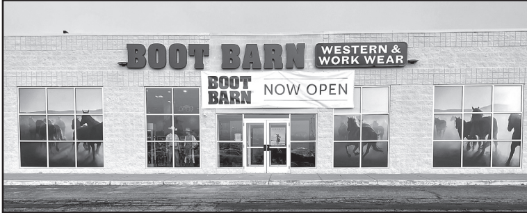
Unless otherwise noted images are from Pinterest